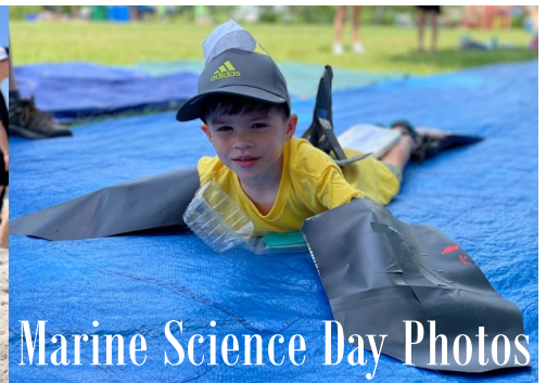
Marine Science Day Photos